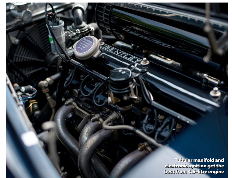
Tubular manifold and electronic ignition get the best from 4.5-litre engine

“The La Sarthe is simply exquisite. Pebble Beach standard. Its styling and finish are an antidote to ‘bling’”