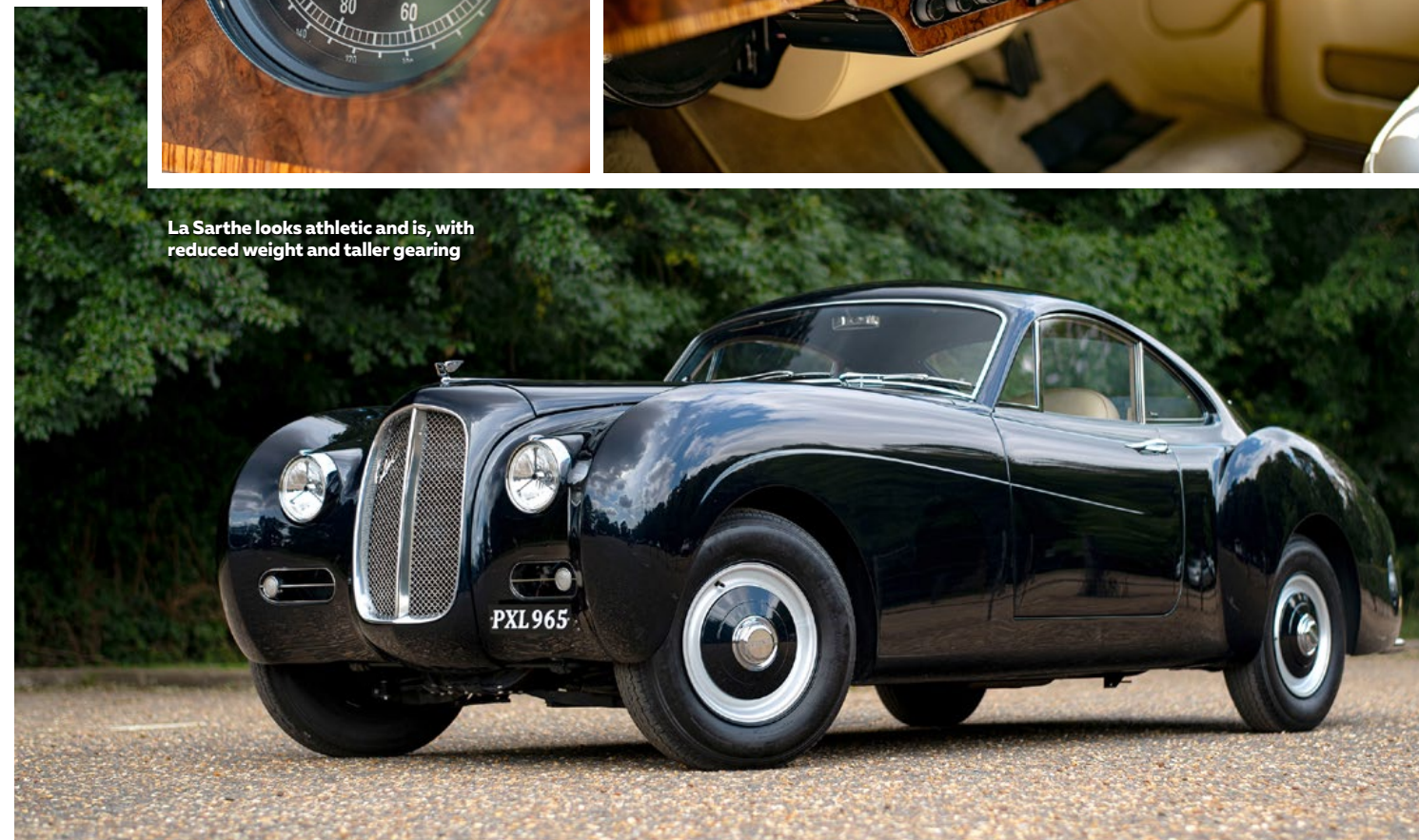
La Sarthe looks athletic and is, with reduced weight and taller gearing