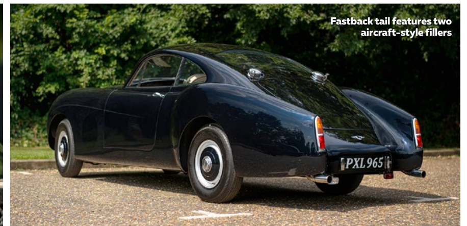
Fastback tail features two aircraft-style fillers