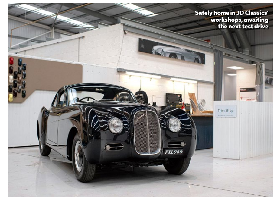
Safely home in JD Classics’ workshops, awaiting the next test drive

I’d like to suggest another profile of potential buyer from among our readers. Those who own, love and regularly use a Cricklewood or Derby Bentley might just consider a La Sarthe as a more comfortable and undemanding way to continue enjoying continental grand tours, club runs and maybe even a run out at Silverstone. The obvious choice here has always been an R-Type or S1 Continental, and it’s good that the La Sarthe introduces something else to consider. And it is indeed worthy of consideration. ■